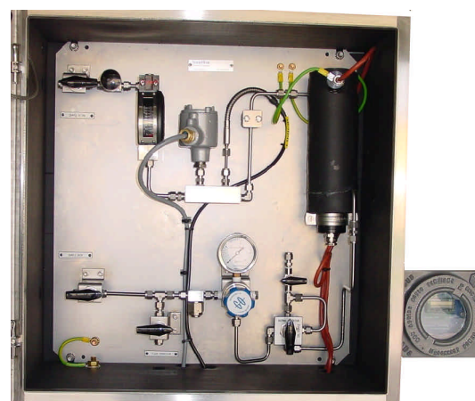
Typical liquid sample system